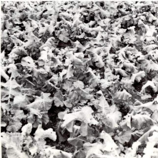
A good crop of broccoli - Green Comet

Now, because of research work done by Caribbean Agricultural Research and Development Institute (CARDI) and supported by the Ministry of Agriculture, some farmers and home gardeners are growing their own Broccoli and even selling surplus to supermarkets and hotels. Consumers who have sampled the locally grown Broccoli consider it of excellent flavour and much better quality than imported Broccoli which is kept in cold storage for several days during shipping, and therefore is not as fresh.