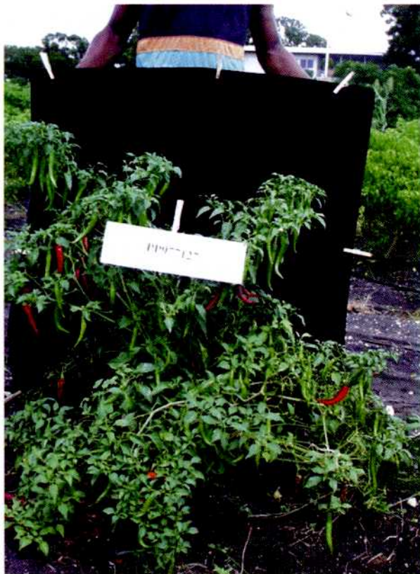
At Left: Showing plant ideotype of Caribbean Cayenne Selection #4 (PP 977 127).