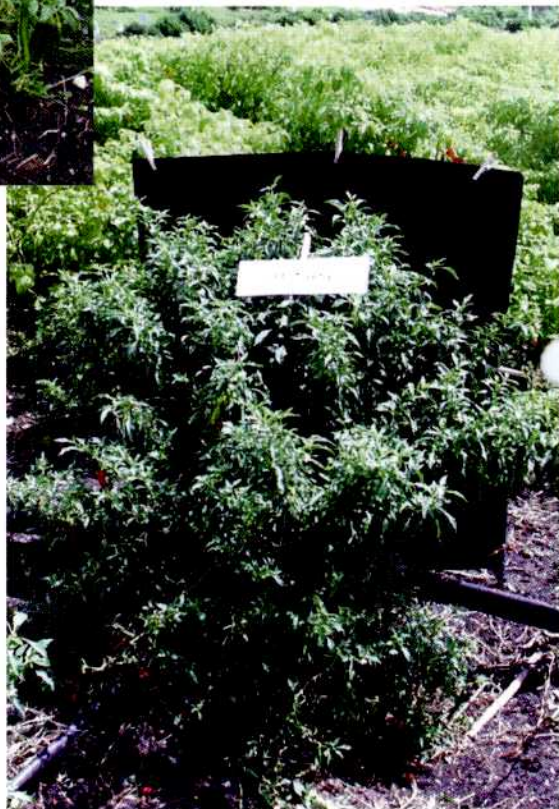
Below: Showing plant ideotype of Caribbean Cayenne Selection #3 (PP 977 197-1).